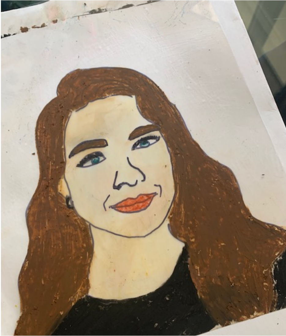
Oil pastel side