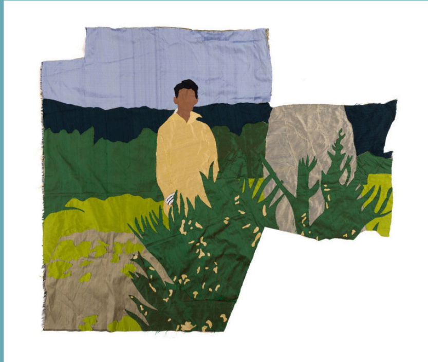
Traveler, 2023 Hand-stitched silk collage, by Billie Zangewa

Her work consists of intricate hand-stitched silk collages, metamorphosing life's changes and emotions into art. Silk was a resourceful and versatile material, allowing her to explore and express her creativity. This process of transformation is reflected both in the nature of the material and in her artistic journey.