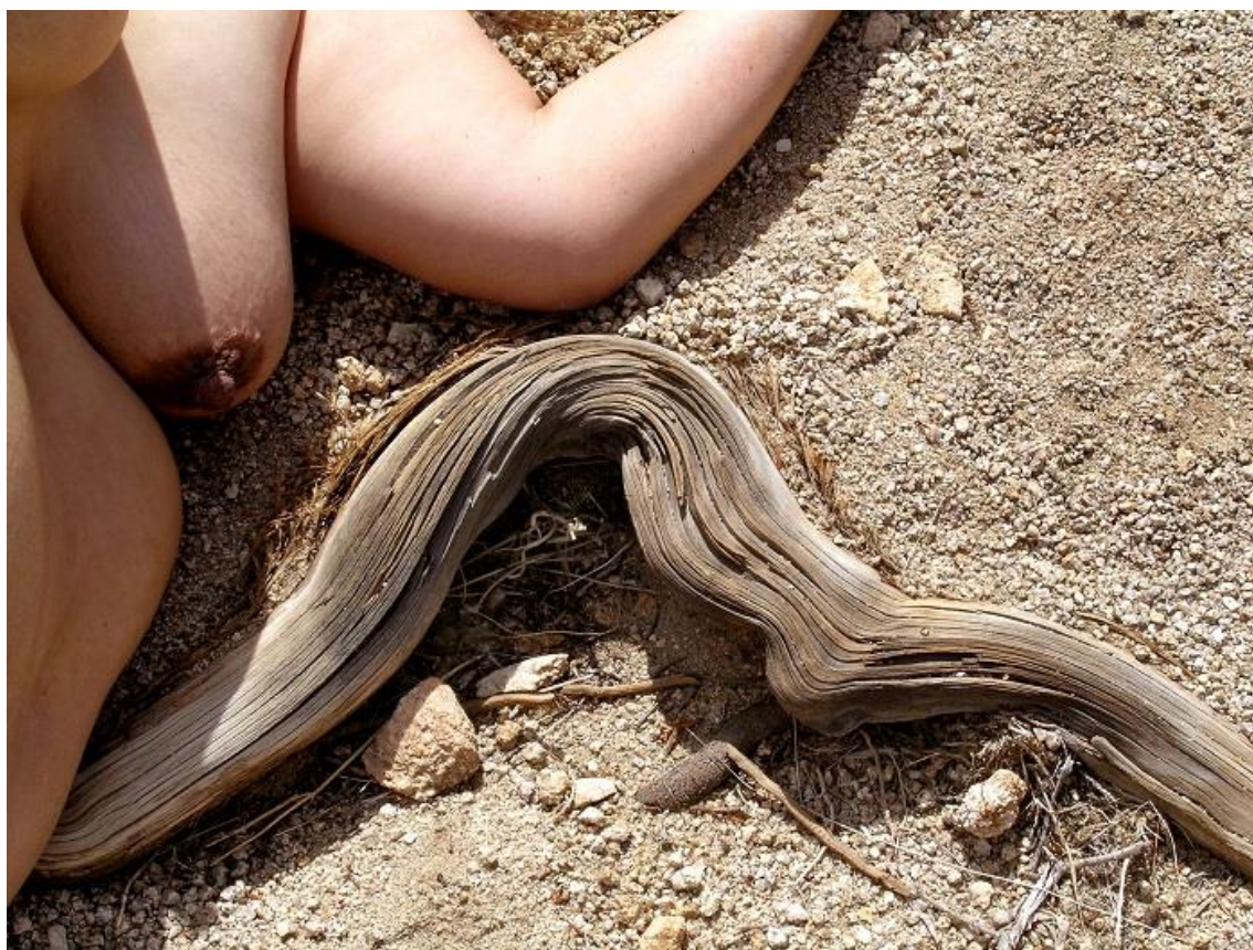
Laura Aguilar, Grounded #108 , 2006. Inkjet print.

Aguilar's works are held in a number of collections, including: the Kinsey Institute for Research in Sex, Gender, and Reproduction; Los Angeles County Museum of Art; Museum of Contemporary Art, Los Angeles; and the New Museum of Contemporary Art, New York City. More than 50 national and international exhibitions include: the 1993 Venice Biennial; the Smithsonian Institution's International Gallery; The International Center of Photography in New York; the Los Angeles City Hall Bridge Gallery, the Los Angeles Contemporary Exhibitions (LACE), the Los Angeles Photography Center; and the Women's Center Gallery at the University of California in Santa Barbara. Awards include: the Anonymous Was A Woman Award and the James D. Phelan Award in Photography . Aguilar was born (1959) and raised in the San Gabriel Valley, east of Los Angeles. She studied photography at East Los Angeles College and was also self-taught.