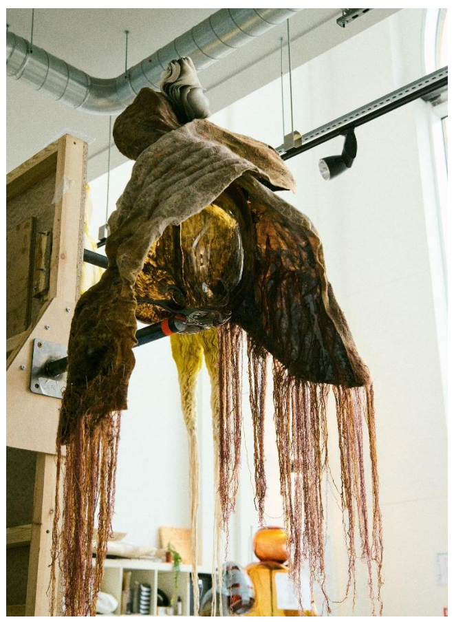
Marguerite Humeau's otherwordly rubber, glass, silk, felt and wool installation \*sky\*/ey- during fabrication