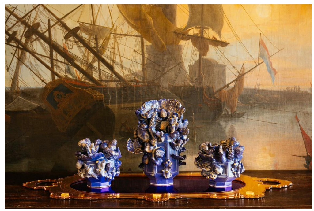
Lauren Shapiro, Spectral Nature, 2024