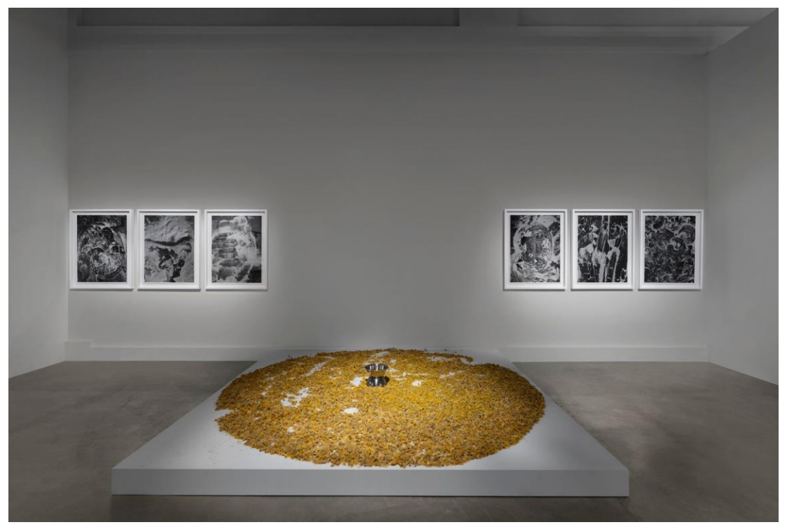
Smita Sen's exhibition at the Museum of Contemporary Art North Miami includes sculpture, works on paper and performance pieces