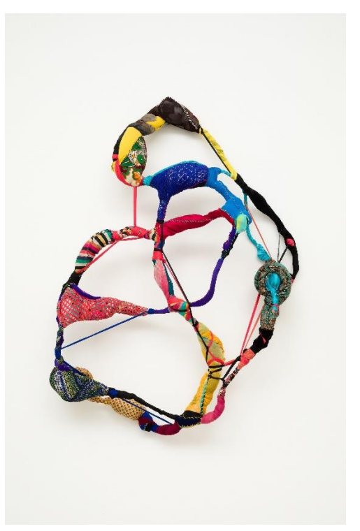
Sonia Gomes combines secondhand textiles with everyday materials, including driftwood and wire, to create abstract sculptures such as Untitled from the series Torções (twists, 2021)