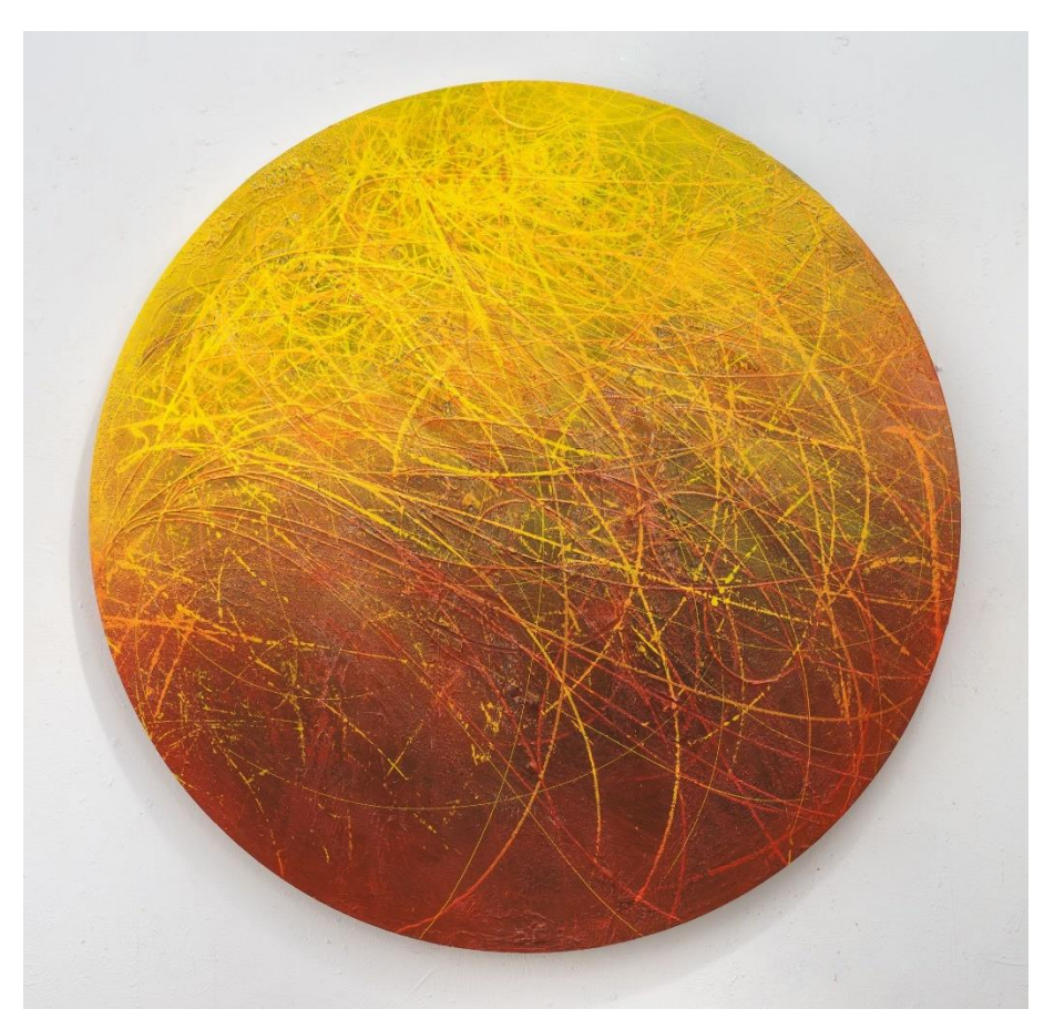
José Parlá, Return to Miami's Ancestral Circle, 2024 Courtesy the artist and Parlá Studios