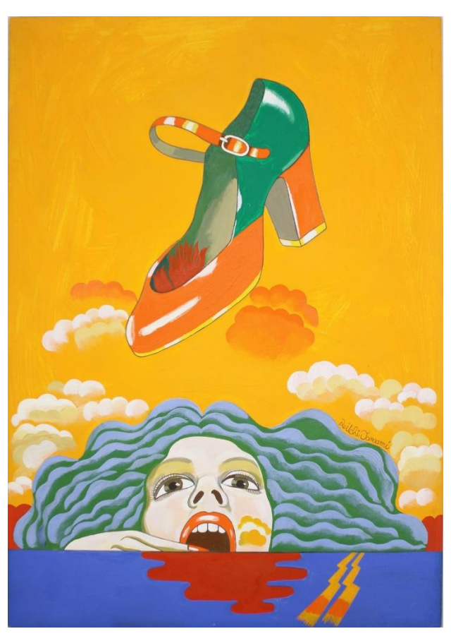
Keiichi Tanaami, Love High Hill, 1973