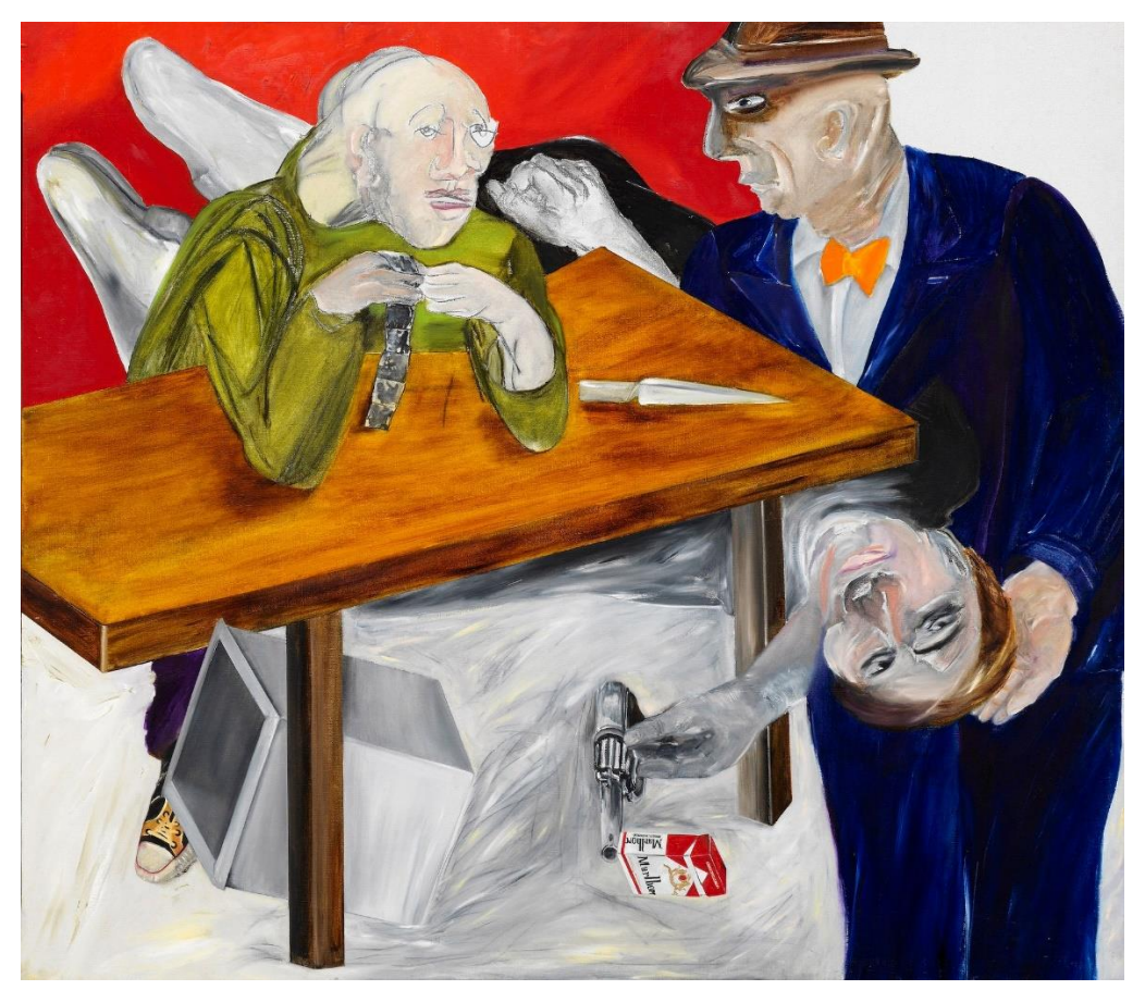
Jacqueline de Jong, Flottant devant les yeux (floating before the eyes), 1981