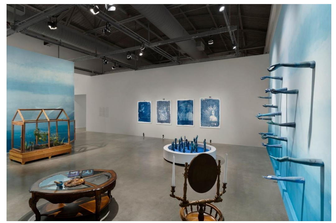
Installation view of Andrea Chung: Between Too Late and Too Early at the Museum of Contemporary Art North Museum