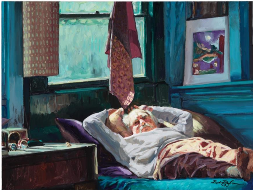
Torn Curtain, Acrylic on canvas, 2021, 36" x 60"

Retrospectrum will be accompanied by a full-color catalogue.