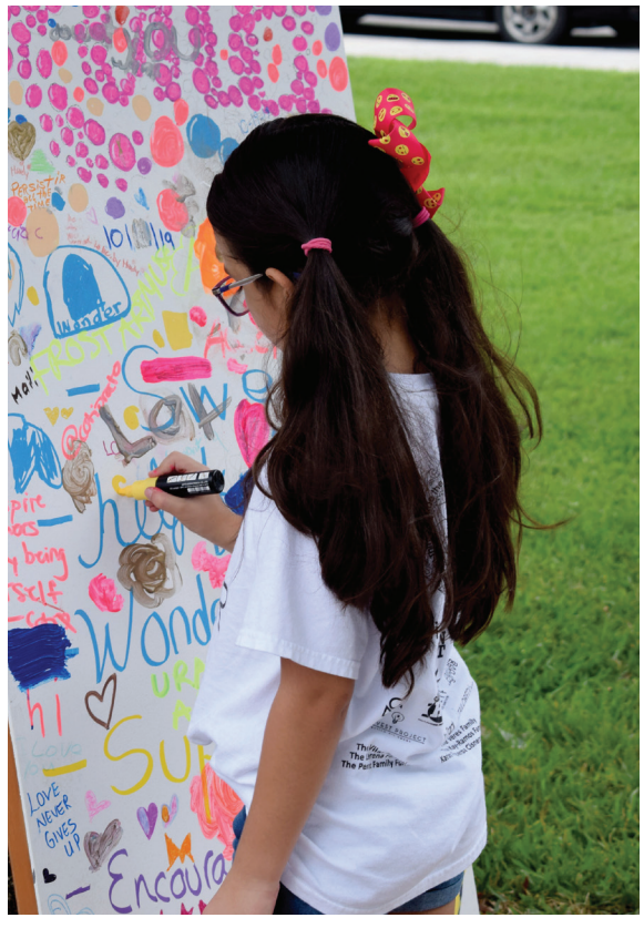
Visitor to Frost Family Day participating in community mural.

Most students visiting the museum this year were enrolled at FIU, including freshmen visiting as part of the First Year Experience program. The museum staff guided thirty-nine tours of Art after