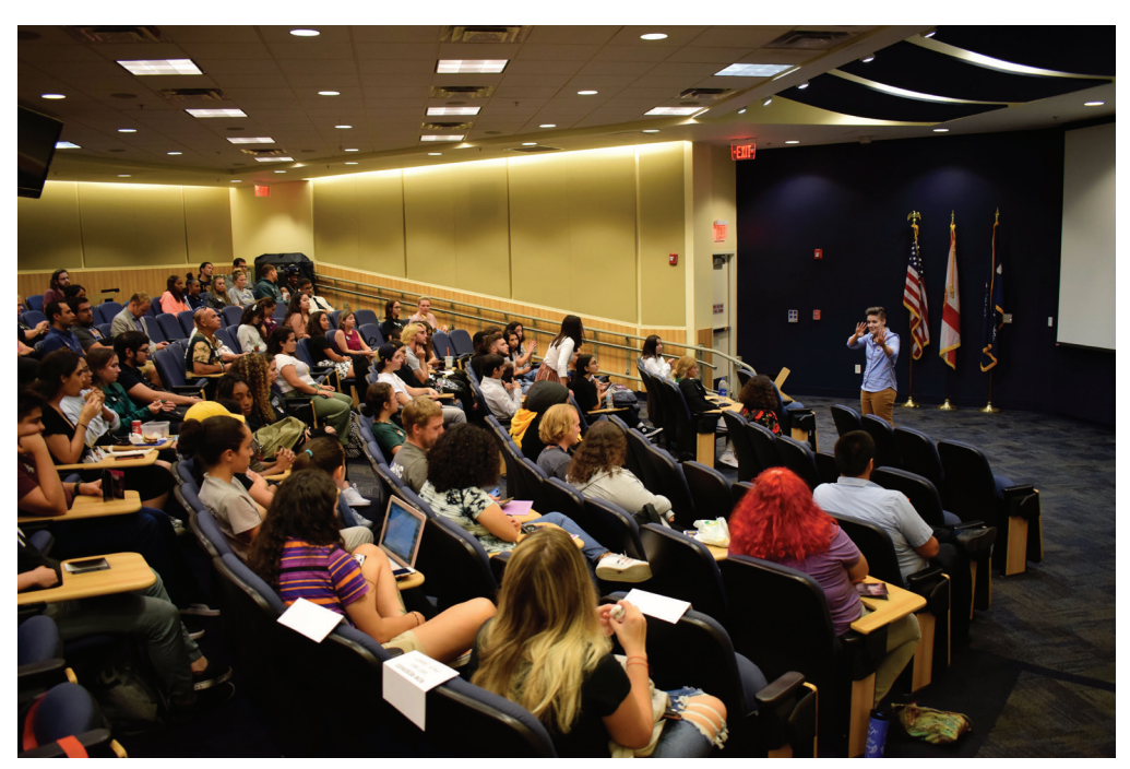
Students gathering for Flaming Classics screening of "The Queen"

The Frost Art Museum continues its commitment to exhibiting art that allows visitors to explore diverse and complex themes and serve as a forum for dialogue and inclusion. Increased LGBTQ+ awareness and education has encouraged Museum partnerships with FIU's LGBTQA Initiatives and Queer Studies professors, staff participation in FIU's Safe